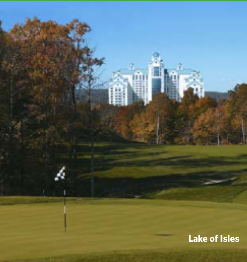
Lake of Isles

North Stonington, CT Travel time - 20 minutes