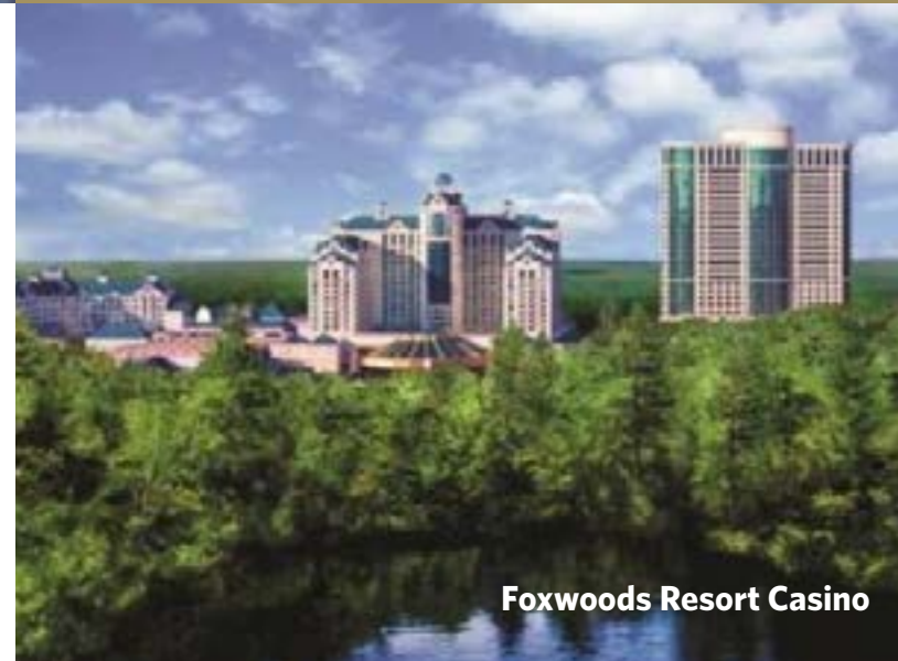
Foxwoods Resort Casino