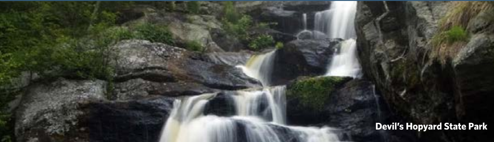
Devil's Hopyard State Park