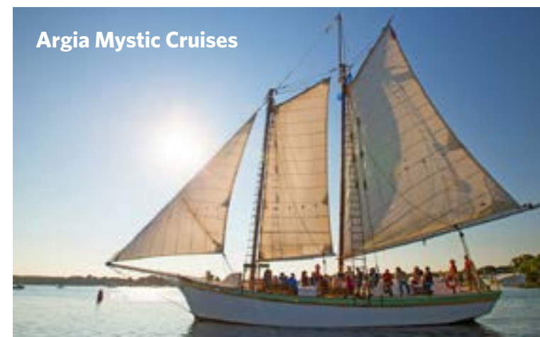
Argia Mystic Cruises