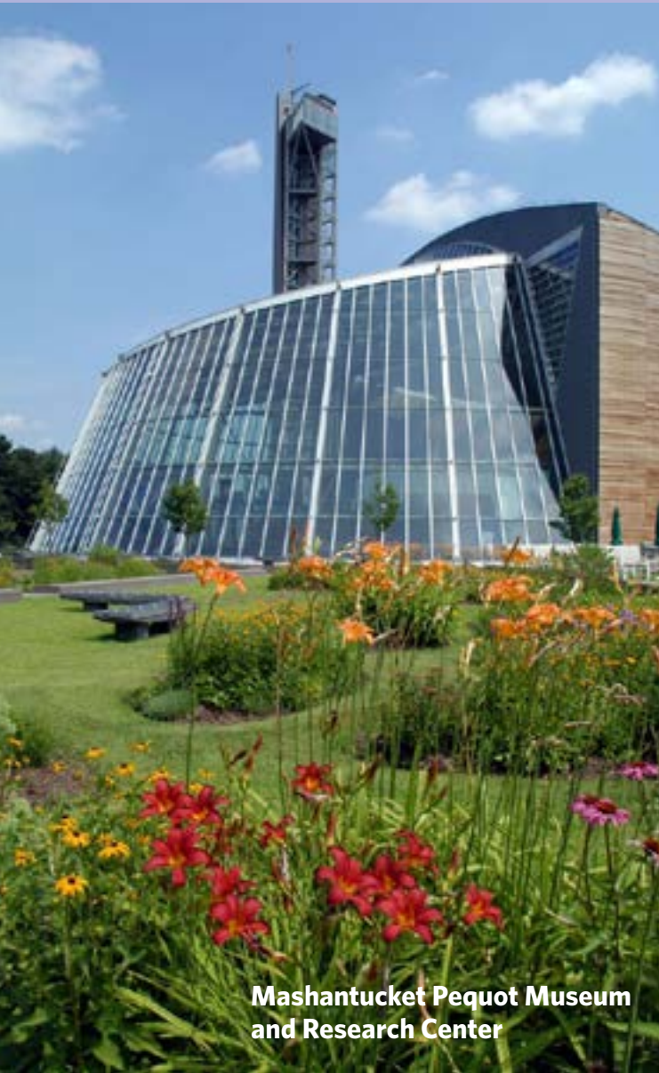
Mashantucket Pequot Museum and Research Center