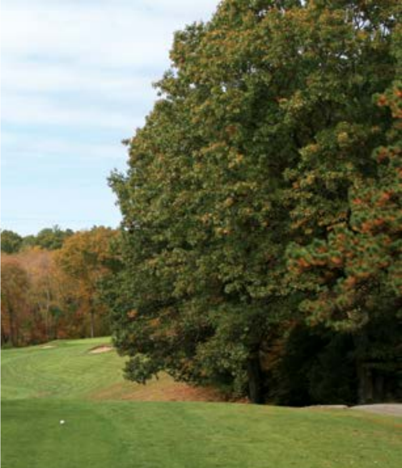
Norwich Golf Course